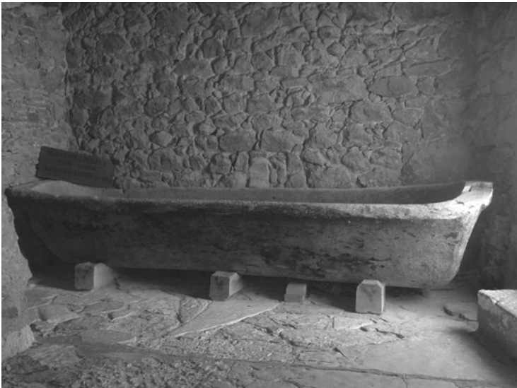
3. Bread kneading trough. St John the Theologian, Patmos

The work was carried out in strict silence. In one version of the Life of Pachomius , the founder gave his deputy Theodore three weeks' penance for letting the monks in the bakery chatter while at their work. Pachomius had left Theodore in charge at Tabennesi while he supervised the establishment of the new monastery